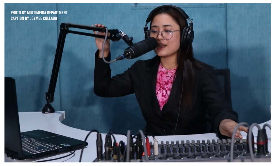
NOW ON AIR. Radio Libertas, the first educational radio station in the eastern part of Pampanga started broadcast last February 2020.

Radio Libertas airs from Monday to Friday with a timeslot of 6 AM to 3 PM while on Saturday programs it will start at 6 AM and end up at 11:30 in the morning. The programs are hosted by chosen teachers of HCC that serve as a DJ on different programs of the station.