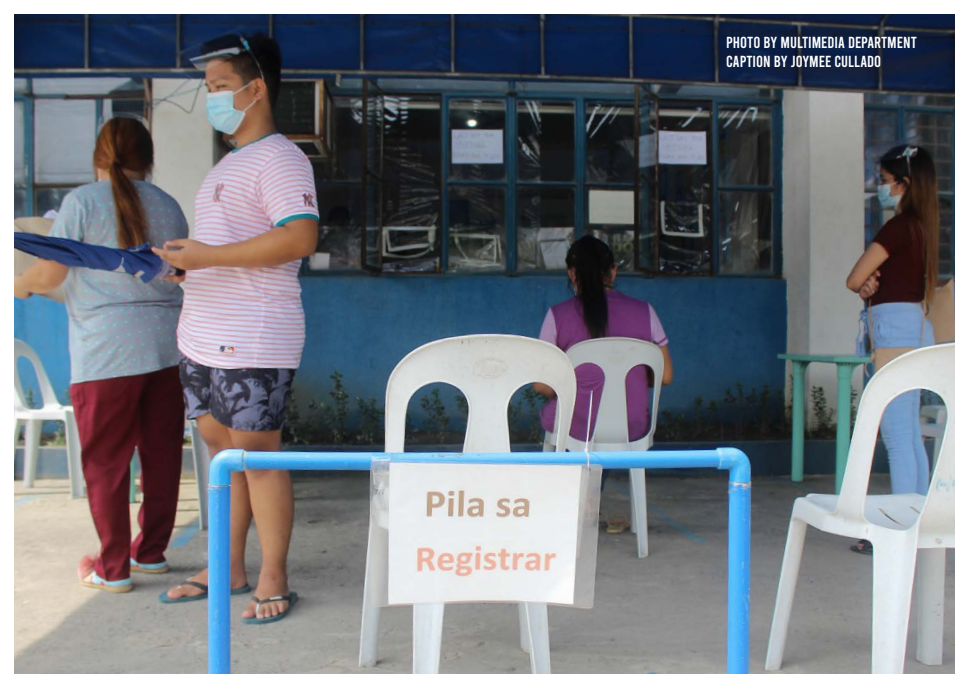
GROWING FAMILY. The school observed health and safety protocols as students queue during the registration period.