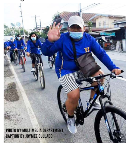
FITNESS DURING PANDEMIC. Twenty-five employees of Holy Cross College joined the first ride of HCC Cycling Club, part of the school's wellness program.

Maaaring makilahok ang mga estudyanteng nasa edad 18- pataas magpasa lamang ng mga kinakailangang dokumento na nakatala sa 'official Facebook page' ng Holy Cross College.