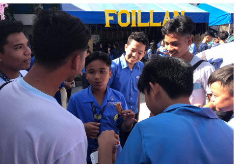
STEM students did sales talk to their customers

HUMSS students sold their products to the grade schoolers.