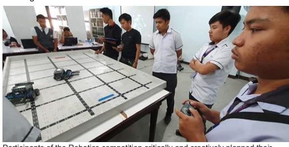
Participants of the Robotics competition critically and creatively planned their moves during the face-off of their robots.

up. It could be recalled that Vex Robotics was already introduced in HCC that sometimes in August 2019 in a seminar-workshop participated by STEM and TVL-ICT students of HCC-SHS